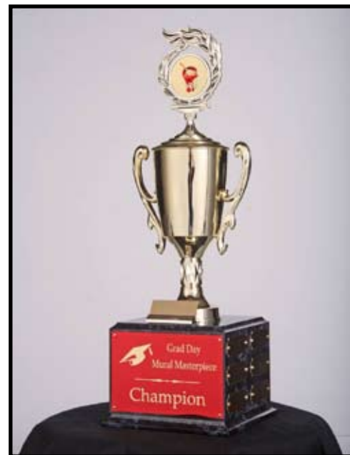
Winner of the War of the Walls Competition wins bragging rights and a traveling trophy.

is announced that afternoon and awarded bragging rights and a traveling trophy.