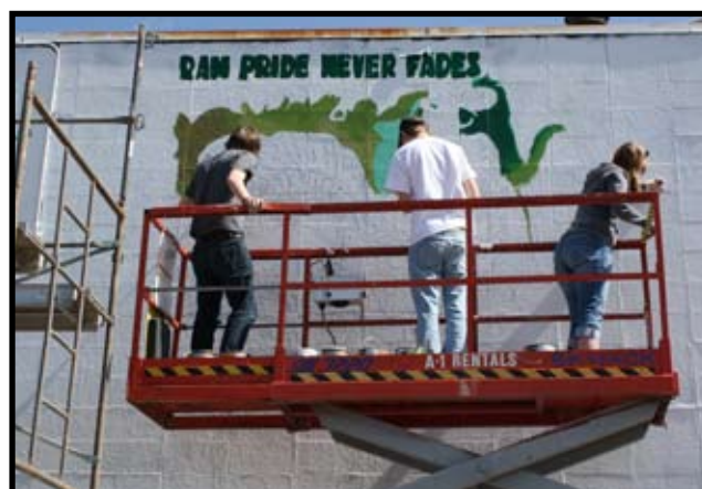
Central High students start work on their mural

People can also view the paintings during the Grad Day fundraising event on May 14 from 7am to 6pm at each MasterLube location. The murals will stay in place through the year until next spring when artists from the class of 2012 add another coat of paint on the walls.